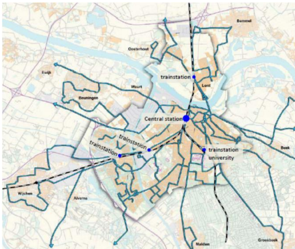
Figure 4: Public transport network of Nijmegen (City of Nijmegen, 2016)

Nijmegen attracts a high amount of traffic, which is generated by its population and employment in the area. The major employers are academic institutions, hospitals, and industries. The daily incoming traffic consists of commuters, students, business people, hospital and city visitors. The outgoing traffic is also mainly employment and education commuters to the surrounding city and the western Dutch urban area in Randstad region (City of Nijmegen, 2016).