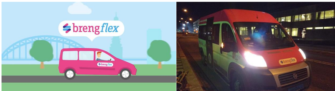
Figure 5: Breng Flex

fleet consists of ten 7-seater buses, powered by eco-gas and eight electric cars. The bus has space for a wheelchair and baby carriages, which, if needed, can be indicated during the reservation. Users can order a ride via a smartphone app or by calling a dedicated phone number. Once a booking is made, the app informs the user about the driver, the type of vehicle, the license plate, the driver's phone number, the estimated time of pick up, and the total journey time. Trip cancellation is possible free of charge for up to 2 minutes after booking. After that, a 70% of the agreed fee will be charged with a maximum of €5.00. Payment can be made via electronic transfer via an app, iDeal (online transfer), credit card, debit card, or OV chip card (Dutch transport smart card), but cash payment is not accepted. The pilot is monitored and evaluated as part of the Smart Cities' Responsive Intelligent Public Transport Systems (SCRIPTS) project.